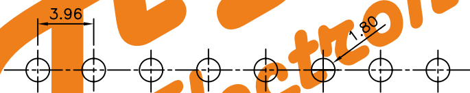
PCB Layout Component Side

AsA Electronic WWW.AsA-Elec.com AsA Electronic Co. Tel : (+98) 21 66 73 56 82 Mob : (+98) 912 03 161 02